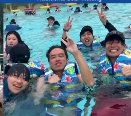
Caribbean Bay Waterpark