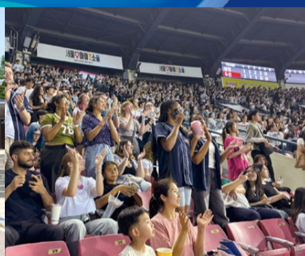
Baseball Game Experience