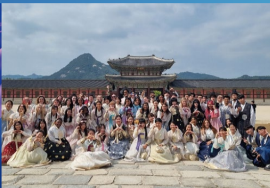
Hanbok Experience at Gyeongbokgung Palace