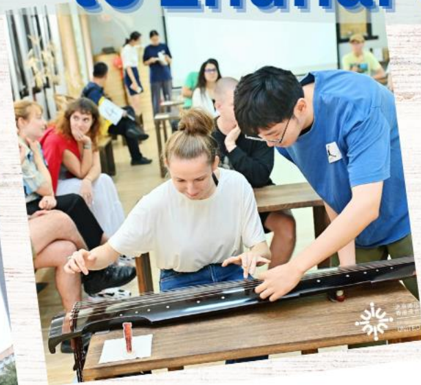
UIC Happy Tour