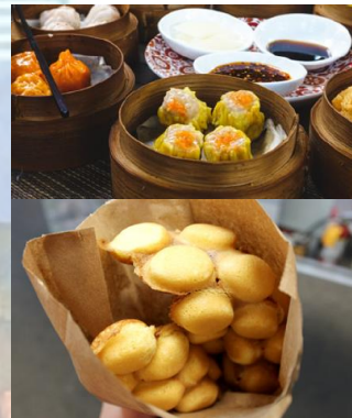
Unforgettable Foodie Encounters