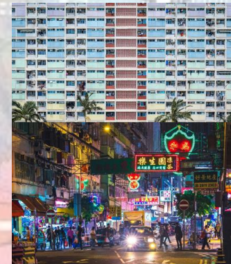
Authentic Local Culture