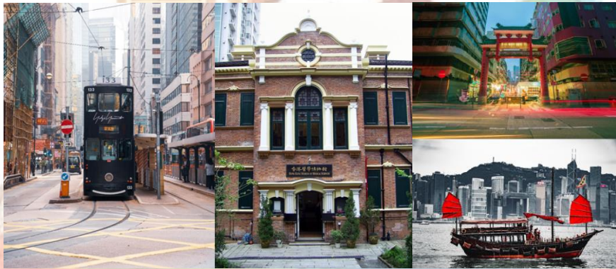
Eastern and Western Culture