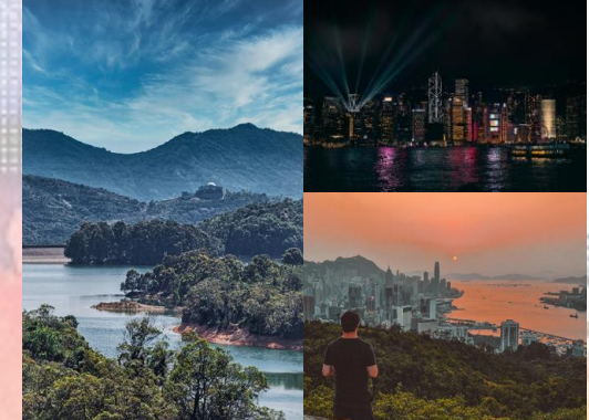
Stunning Skyline & Breathtaking Landscapes