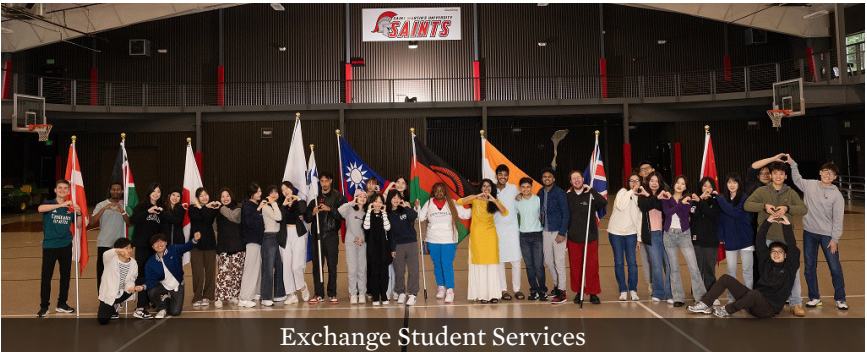
Exchange Student Services